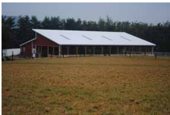
Pictured Left: The sheep dairy barn at Shepherds Manor Creamery, featured on page 16.